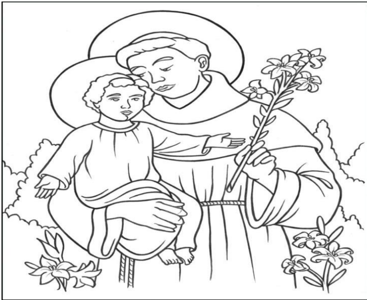
Saint Anthony - TheCatholicKid.com